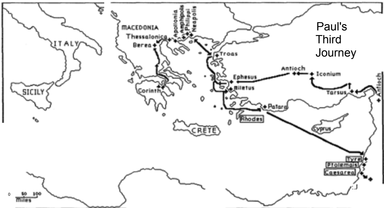
Paul's Third Journey