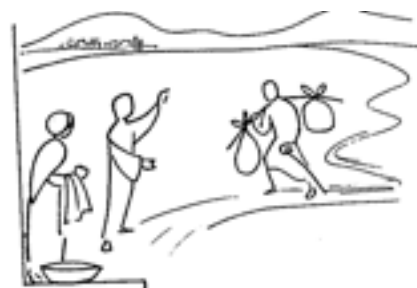
Receive him as a brother. (2.29)