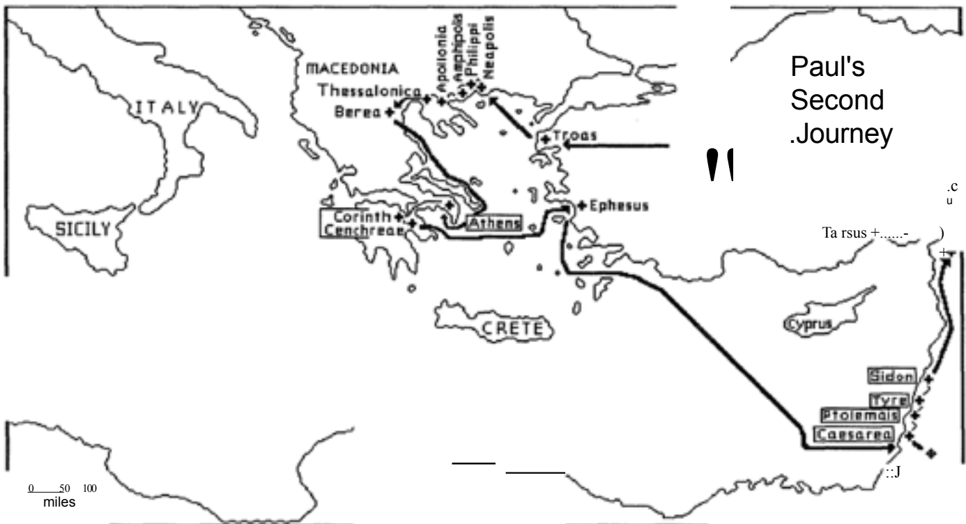
Paul's Second Journey