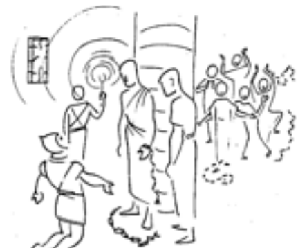
"What must I do, sirs, to be saved?" (16.30)